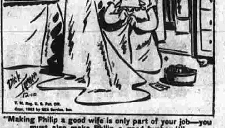
Making Phil a good wife is only part of your job—you must also make Phil a good husband!