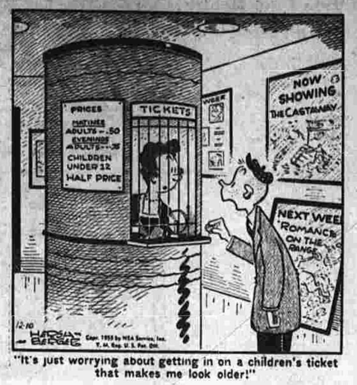
NOW ON THE CARTWAY