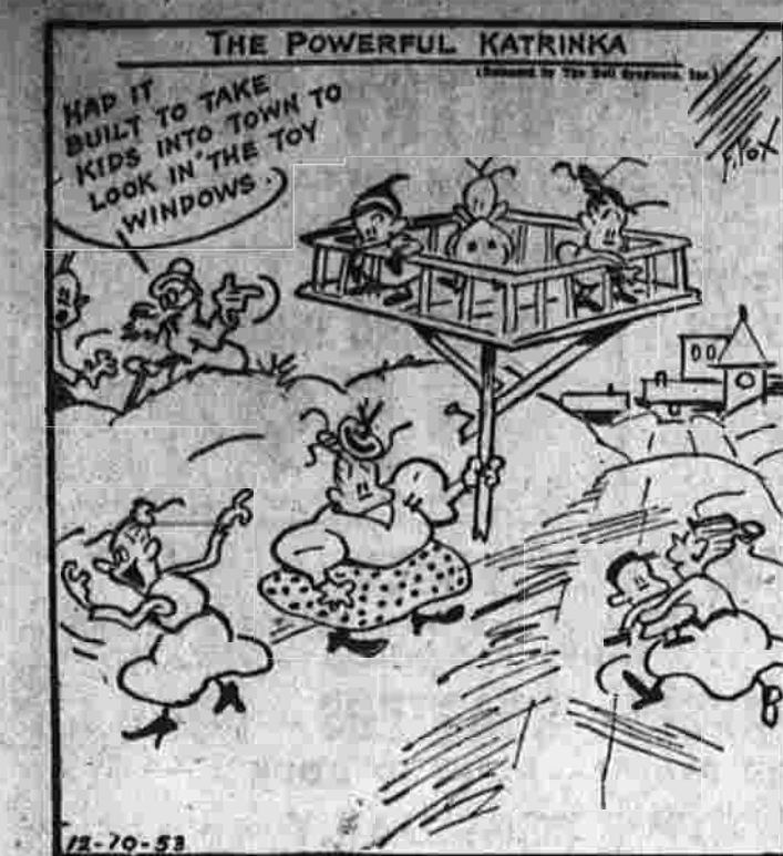
THE POWERFUL KATRINKA