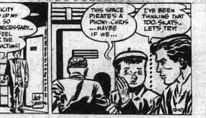
DEEP BARK SECRET