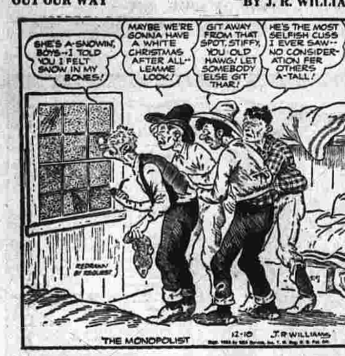
OUT OUR WAY

A salesman was hearing his salesmen for not making more calls on customers, saying that from now on he would expect each salesman to report at the end of the day the number of calls made.